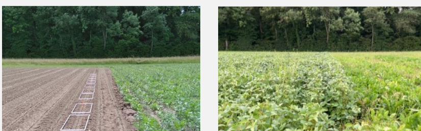
Figure 2: Field at the start of the experiment (left) and after the second measurement of weed numbers [right].